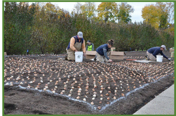
Gardeners at work planting spring bulbs in the Display Garden

come prepared with weather-appropriate clothing which can withstand dirt.