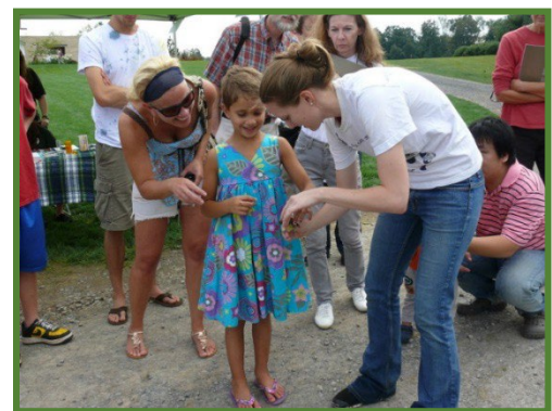
An Arboretum bird -banding volunteer