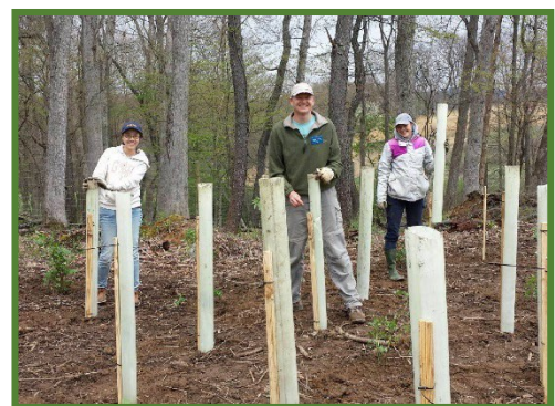
Volunteers at work in Hartley Wood