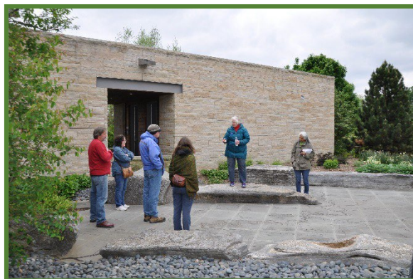
A docent-led tour underway in the botanic gardens