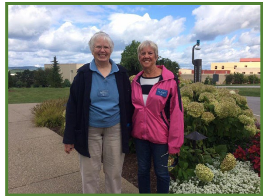
Greeters ready to welcome people to the Botanic Gardens