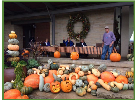
Pumpkin Festival volunteers running the registration for entries to the pumpkin-carving contest