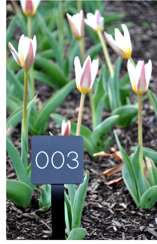
Tulipa 'Ice Stick' with a seasonal display label