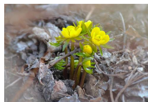
Eranthis hyemalis in bloom