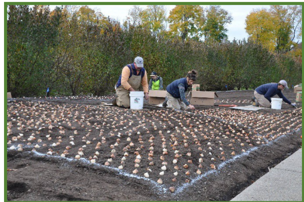
Gardeners at work planting spring bulbs in the Display Garden

come prepared with weather-appropriate clothing which can withstand dirt.