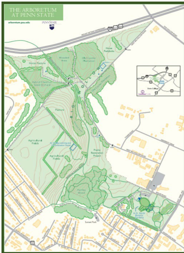
Map of The Arboretum at Penn State. The H.O. Smith Botanic Gardens are located on the lower right, along East Park Avenue. The natural lands areas extend from the botanic gardens to I-99/US 322.

The Arboretum at Penn State covers 370 acres, including the intensively maintained H.O. Smith Botanic Gardens (30 acres) and the natural lands outside the garden (340 acres). The natural lands areas contain a fragment of old-growth forest (Hartley Wood), the Prairie Restoration Project area, the Hybrid Chestnut Seed Orchard, and an extensive trail network which includes the Bellefonte Central Rail Trail and Gerhold Wildflower Trail.