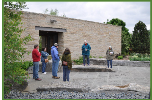
A docent-led tour underway in the botanic gardens