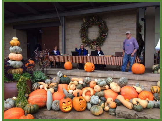
Pumpkin Festival volunteers running the registration for entries to the pumpkin-carving contest