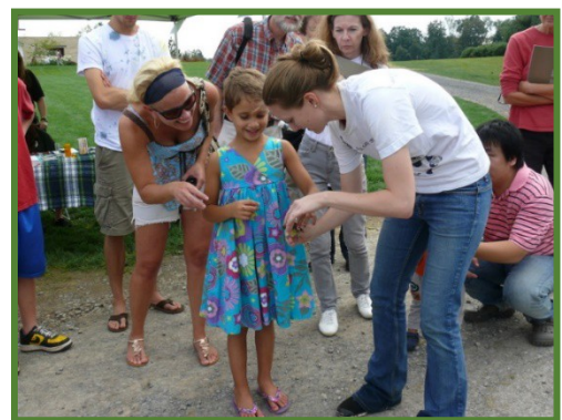
An Arboretum bird -banding volunteer