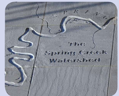
Profile Image: Stacy Levy • Second Image: Fredric Weber • References: stacylevy.com ; artfulrainwaterdesign.psu.edu ; wikipedia.org/wiki/Stacy_Levy

This publication is available in alternative media on request.