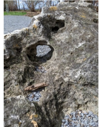
A boulder with a hole that goes all the way through.