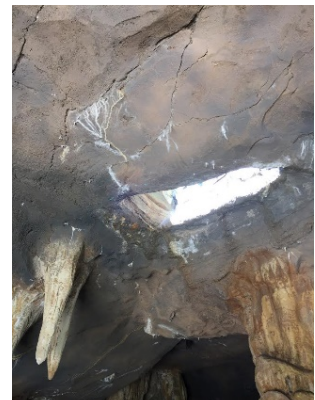
Stalactites in a cave.