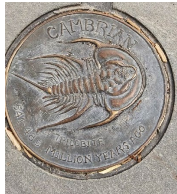
A trilobite. Pennsylvania's state fossil is the trilobite Eldregeops rana !