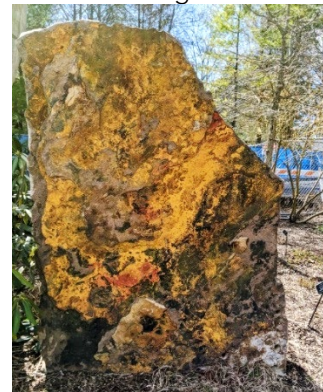
A boulder covered with colorful minerals.