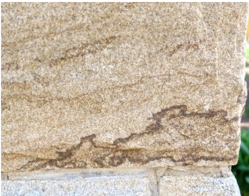
Sandstone rocks with interesting mottled patterns on them.