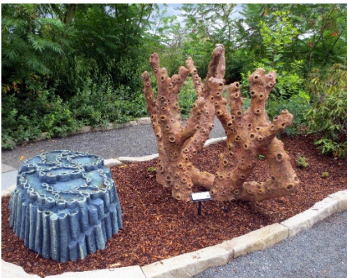
Sculptures of corals that lived hundreds of millions of years ago, when Pennsylvania lay beneath the ocean.