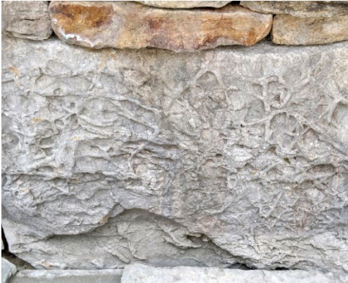
Fossilized burrows made by marine animals.

There are many interesting rocks in the botanic gardens. How many can you find?