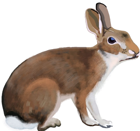
Look for the white blaze on this eastern cottontail rabbit's forehead.

There are two species of wild rabbits in Pennsylvania.