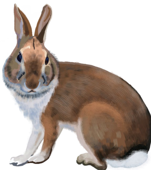
This Appalachian cottontail rabbit has a black blaze on its forehead.

The Appalachian cottontail ( Sylvilagus obscurus ), also known as the woods rabbit or timber hare, is found at higher elevations in the state. Appalachian cottontails are slightly smaller than eastern cottontails and have a black blaze on their foreheads. (Some eastern cottontails also have a black blaze, which makes the two species hard to tell apart.)