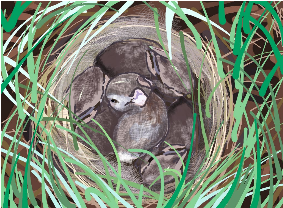
Baby rabbits in a shallow nest. How many babies do you see?

Gardeners and curious pets often uncover rabbit nests. If you find a rabbit nest, the best thing to do is to cover it back up and leave it alone.